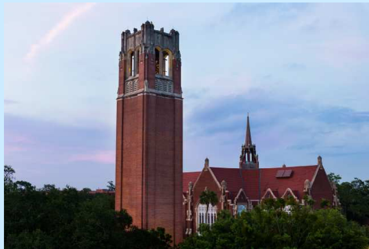
University of Florida

University of Florida Presentation Room 2000 Farrior Hall 205 Fletcher DR Gainesville, FL 32611