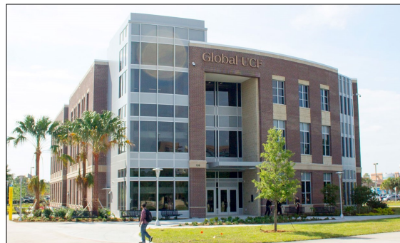
Global UCF Building